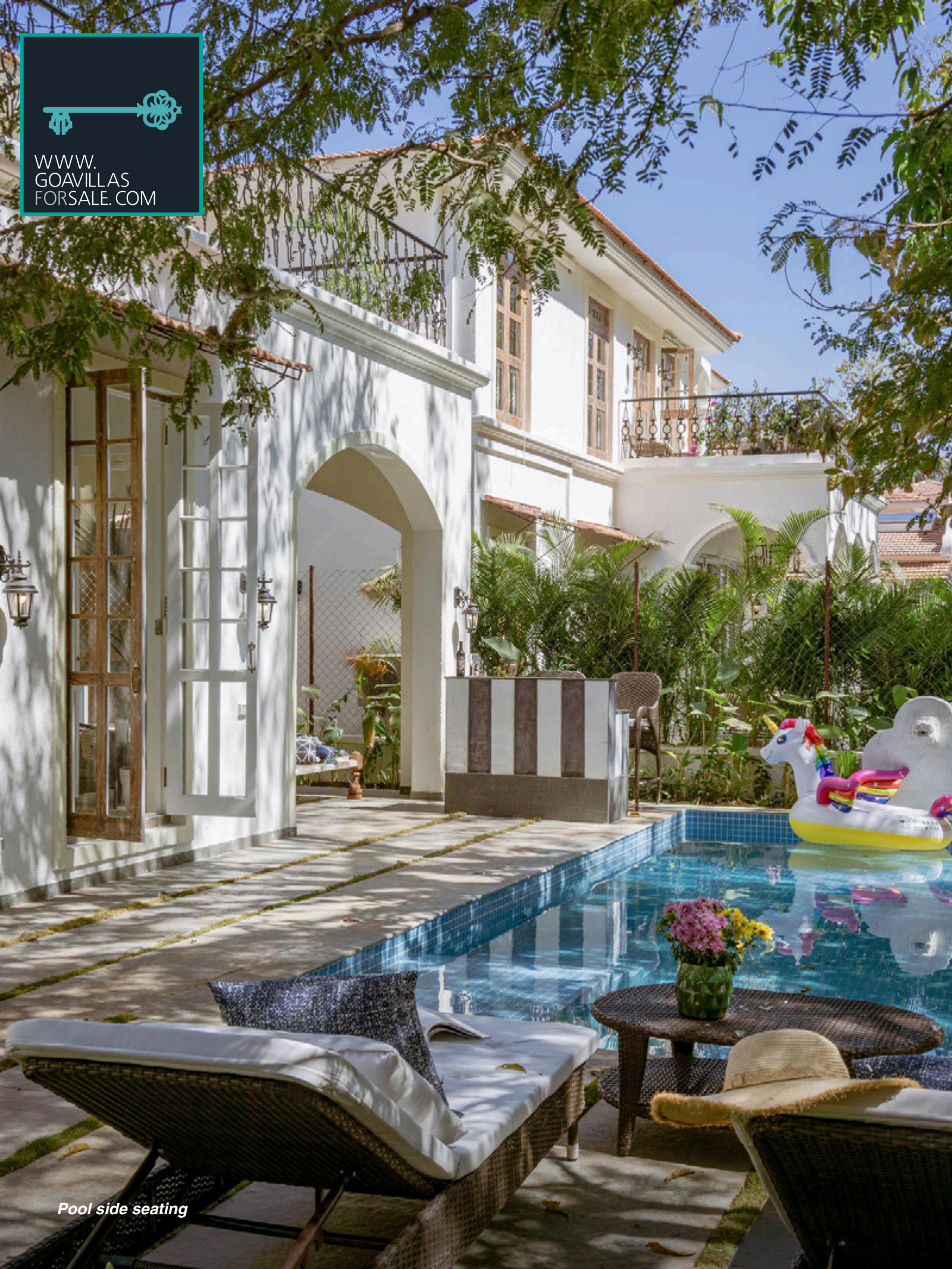
Pool side seating