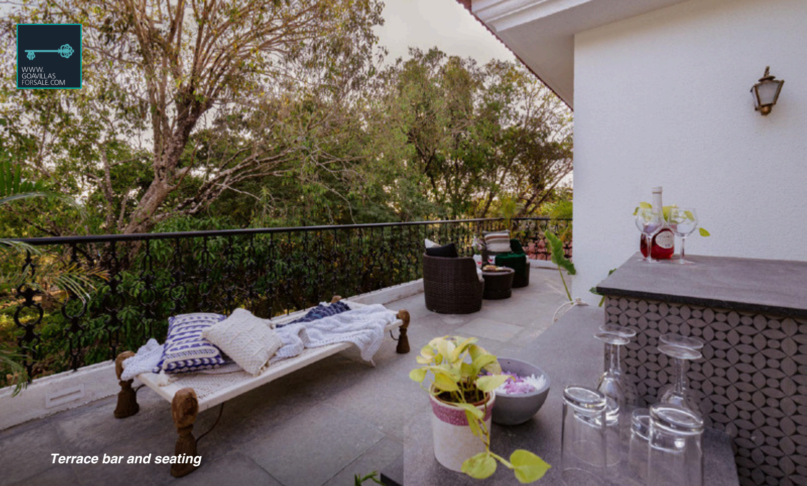
Terrace bar and seating