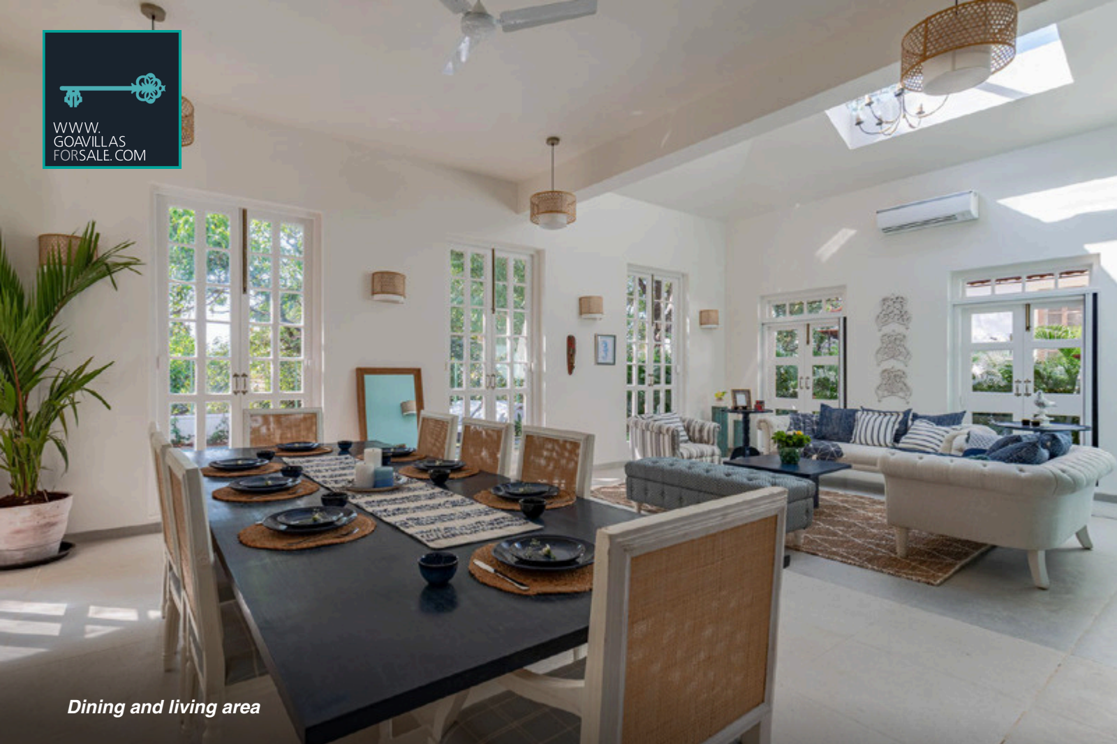
Dining and living area

Casa Assagaon – A luxurious 3BR ensuite villa with a carpet area of 2,800 sq. ft. on a 345 sq. m. plot, nestled within the prestigious Casa Assagaon Villas.